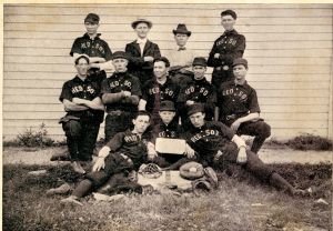
KEWANNA REDBOX BASE BALL CLUB.