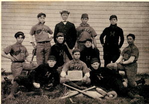
HOWELL BASE BALL CLUB.