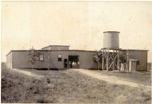
HEINE PICKLE SALTING WORKS.