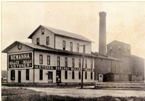
A. D. TONER, MILL AND ELEVATOR.