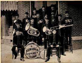
KEWANEE CORNET BAND.